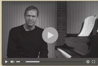
Enhance your learning with instructional videos by world-renowned pianist and educator Randall Faber.

This book offers musical instruction that will guide you as a beginning adult learner. Over two hours of instructional video provide a professional perspective to accelerate your musical training. Supporting audio tracks convey a sonic world of rhythm, melody and harmony — essential for learning musical concepts.